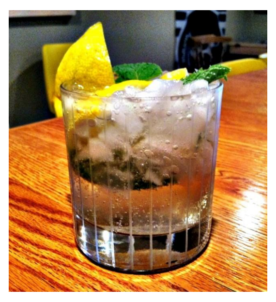
Cocktaíl a la Louisiane