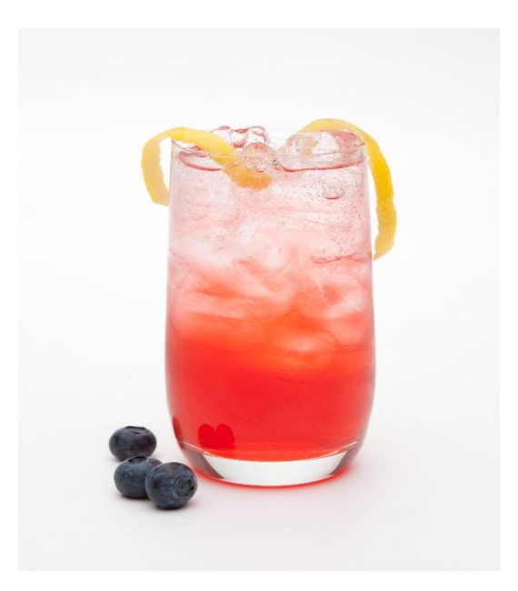
Sloe Gin Fizz